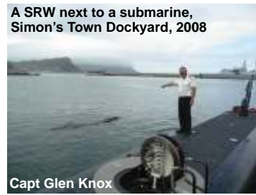
they don't get closer than this